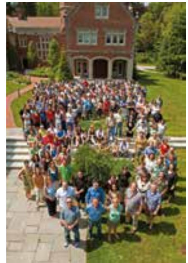
L'équipe de NEB Inc., maison mère, à Ipswich, USA.

Les prix peuvent changer à tout moment sans avis préalable, sauf erreurs et omissions.